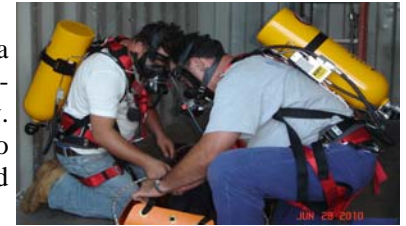
Rescue Team Training

June 2010 was “Confined Space Month” at Spectraserv as 60 employees attended a refresher training course for Confined Space and Respiratory Protection. Spectraserv contracted with HazTek to instruct and perform fit testing for 2 Spanish classes and Prime Env. to teach a class in English. Prior to attending the class, each employee was required to obtain respiratory clearance through medical testing and examination. This was achieved through one of Spectraserv’s contract medical facilities.