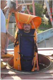
Confined Space Victim Extraction

In order to maintain Spectraserv’s capabilities in performing its own confined space rescue, rescue team crews performed their annual confined space mock entry and rescue event. During this exercise they practiced many different scenarios of confined space rescue. This training exercise gave the team experience in tying knots, working with donned SCBA, preparing the victim for transport and safe extraction of the victim from a confined space.